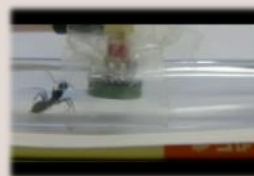
An ant moving under a sensor